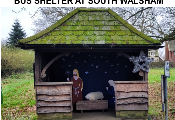
BUS SHELTER AT SOUTH WALSHAM

On the first Monday of each month, the churches of Fishley, South Walsham & Upton organize a get-together in St. Lawrence's Church between 12.30 and 2.30pm. We provide light lunches, tea, coffee and cakes, and lots of chat! The next meeting is on the 3rd February. There is no charge, but donations are always welcome. From time to time, as funds allow, we donate to various charities and often have raffles in aid of specific causes, for example, Macmillan, Breast Cancer and Great Yarmouth foodbank. A warm welcome is extended to people in the Benefice, we would love to see you. Just come along any month.